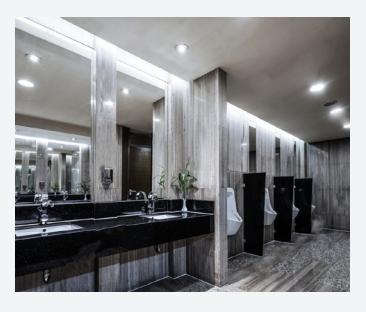
Medklinn Air+Surface sterilizer works 24/7 to remove unpleasant smells like urine and cigarette smell.